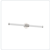
VL18532-BN Brushed Nickel